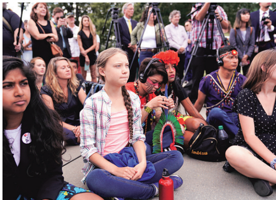
Swedish climate activist Greta Thunberg (centre) listens to speakers during a climate change demonstration at the US Supreme Court in Washington. A global movement backed by her got underway on Friday, with students in Europe and Australia skipping school and workers walking off jobs to demand action on climate change

Royal Bank of Scotland Group promoted Alison Rose to chief executive officer, making her the first woman to run one of Britain's big four lenders. Rose, the former head of British commercial and private banking at RBS, was seen as being groomed for the role for years. She takes over on November 1, set to be the UK's first day outside the European Union. RBS has said the uncertainty around Brexit has taken it off course from next year's target of 12 per cent returns on tangible equity. BLOOMBERG