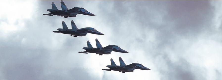
Military jets take part in strategic command and staff exercises Center-2019 at Donguz shooting range near Orenburg in Russia on Friday. The main theme of the drills is the use of a coalition Army group in the fight against international terrorism and providing military security in Central Asia. India is one of the countries participating in the drill